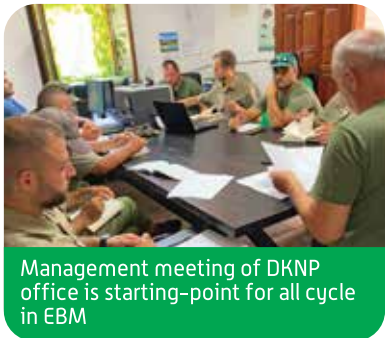
Management meeting of DKNP office is starting-point for all cycle in EBM

DKNP management office is one and only agency to concentrate on work for park. There is limited resources but by increasing its coordination capacity, DKNP office seeks to deal with all related issues of the National Park as the secretariat of the PMC. Management office also seems to be a base of public relation including tourism by collaborating with industry.