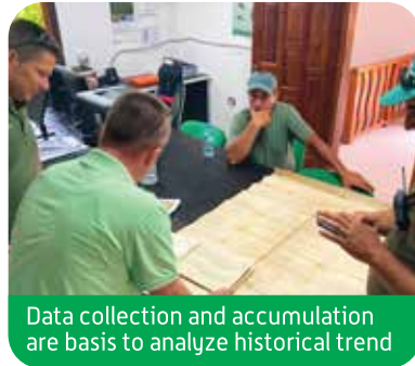
Data collection and accumulation are basis to analyze historical trend

The project applies a model of EBM that must be based on the scientific information/ data obtained from monitoring of all sort of aspects in Divjake-Karavasta national park as well as PDCA cycle on extracted issues and, revision of management plan timely. Thematic working groups involve in this process practically to carry out all the measures what PMC indicated.