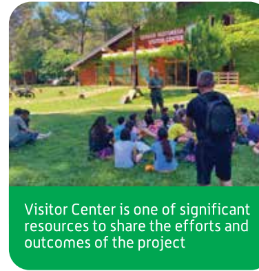
Visitor Center is one of significant resources to share the efforts and outcomes of the project

There are many different ways to improve EBM so that sharing practical experiences both inside and outside the DKNP promotes. It is not only education purpose but also in order for the project to compile wide variety of information along the line and for other parks in and out of Albania to get alternative ideas. The project also ready for exchange views and experiences with practitioners who are working on EBM