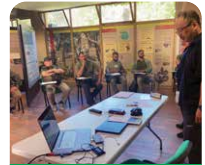
Training on Bio-Diversity Monitoring

Staff development such as a technical training is an important source for staff of management office to understand EBM and to contribute to improve it through their specialty and proficiency. introduction of thematic skills or services to the DKNP office has been started. They are assigned in specific theme with WG based on their background. Furthermore, the project helps routinization of new services by repeating the cycle of the PDCA.